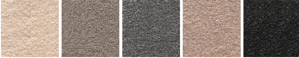
SATISFACTION 33 SATISFACTION 39 SATISFACTION 95 SATISFACTION 36 SATISFACTION 98

AWE -IZ "Klein Frankrijk", Weverijstraat 1 - 9600 Ronse Belgium - Tel + 32 55 23 02 11 -