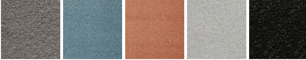
SATISFACTION 49 SATISFACTION 74 SATISFACTION 82 SATISFACTION 92 SATISFACTION 99